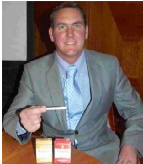
NO SMOKE WITHOUT FIRE? The world's first smokeless cigarette is to be unveiled in Bournemouth later this month

The company says the product was developed in Germany using nano-technology.